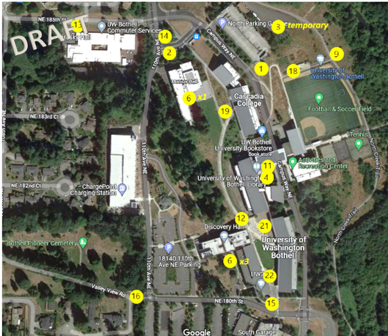
Table 1 – Full legend is included within the CDRT 2021-2022 End of Academic Year Report Appendix 2