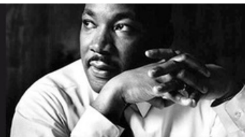
Martin Luther King Jr. speaking on racial segregation of hospitals

I SEE NO ALTERNATIVE TO DIRECT ACTION AND CREATIVE NONVIOLENCE TO RAISE THE CONSCIENCE OF THE NATION.