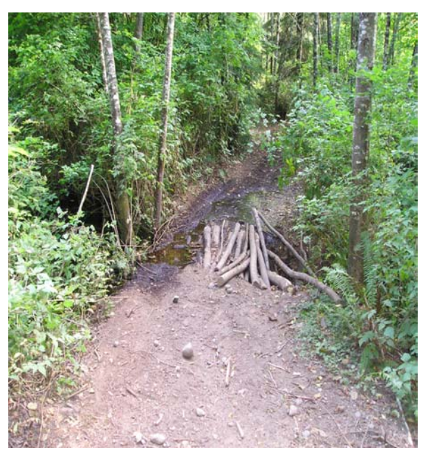
Section IV trail crossing Bear Creek Tributary, June,2003; crushed culvert and logs that were blocking stream flow were removed July, 2003.

Section IV- Trails in Section IV are currently used by all of the above user groups. Trails have been cut through the forested areas as well as in riparian zones and wetland areas. Trails go through Big Bear Creek in some locations.