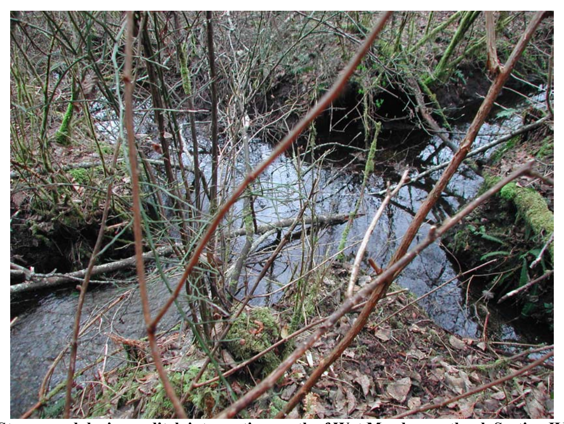
Stream and drainage ditch intersection south of Wet Meadow wetland, Section IV

below. There is potential to redirect flows from the ditch that begins south of the Lloyd house and east of Paradise Lake Road and to enhance the wet meadow wetland system's hydrology and to increase storage of summer water.