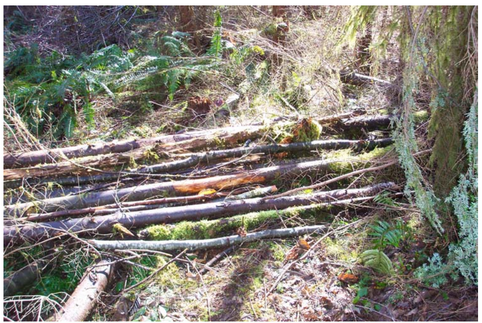
Log "jump" installed on western trail in Section I

southern boundary of the PVCA onto private property. There are locations where "jumps" for mountain bikes have been installed along the trail.