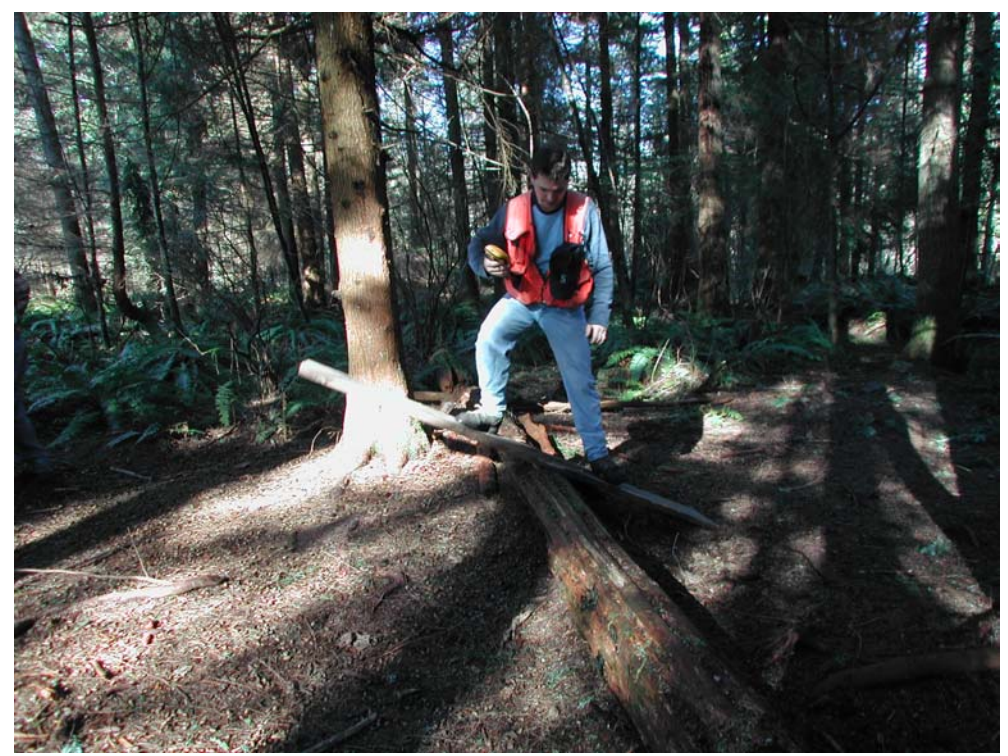
A bicycle "teeter-totter" hinged to a log on the Lloyd Double Diamond Trail

There are two (2) PVCA entry points to the northern part of Section II at the end of County Roads. The main trail at the bottom of the steep slopes on the east part of this quadrant was at one time a railroad grade; during heavy rainfall events, water flows down the chutes to the road "downstream" and at times the road appears like a stream. This drainage way is part of the headwaters of Crystal Springs Creek, a tributary of Bear Creek. Eight (8) trails extend from the southern and southwest boundaries of Section II onto private property (owned by the Lloyd Family).