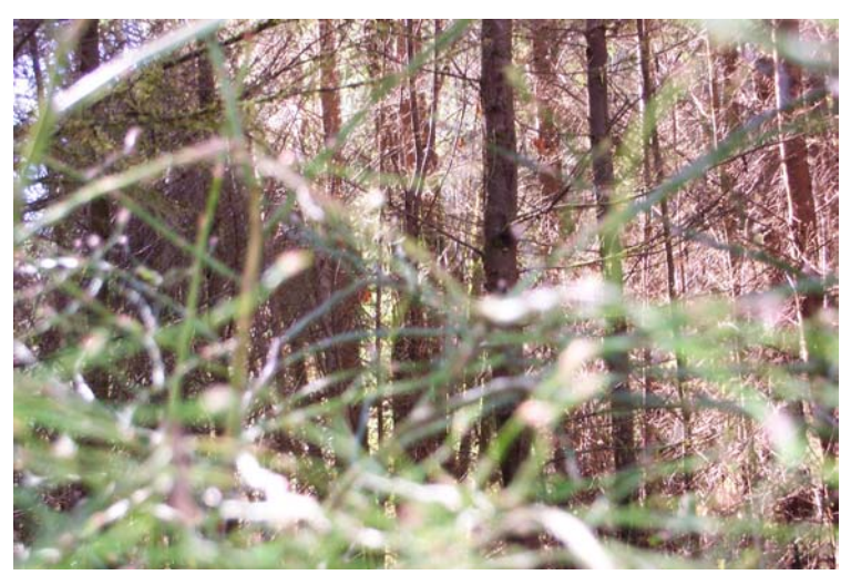
Dense growth in Section I

quadrant is 440 feet, with gentle slopes to the west and east dropping to 420 feet. The trees in this quadrant are approximately 15 year old. The density of the low growing understory vegetation is very thin due to the dense growth of trees.