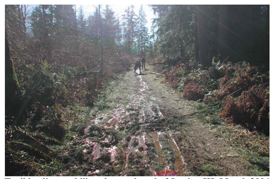
Trail leading up hill to the south end of Section III, March 2004

Section III – Trails in this section lead through mature forests and wetlands north of Paradise Lake Road, and cross through tributaries of Bear Creek. Also Mr. Olsen was given verbal permission by the Lloyds to construct a road from Paradise Lake road to the Olsen property on the east boundary of Section IV. That road, locally referred to as 228<sup>th</sup>, is described further in the Road section below. South of Paradise Lake Road there are more than two-miles of long looping trails that lead to the south end of the section.