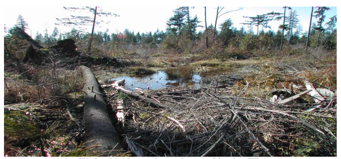
Wetland in the southern plateau of Section III

These trails loop around and through a high plateau that has large wetlands in its center. These wetlands drain to the north and east into Bear Creek and to the west into the Cottage Lake Creek watershed.