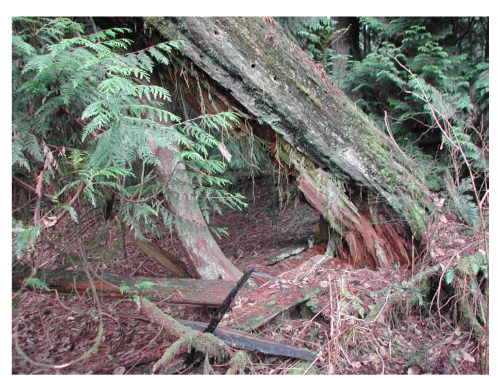
Mature Forest in Section IV next to Paradise Lake Road south of the Lloyd life estate

The Lloyd family logged all of the old growth timber from the site over the past 100 years. With proper planning, and a lot of time, much of the native forest can be restored. Some sections of forests are mature (60-100 year old trees), while others have been logged during the last 10-15 years.