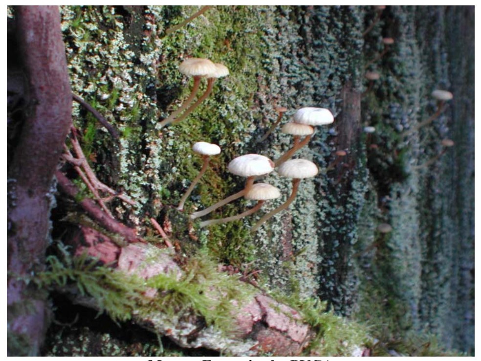
Mature Forest in the PVCA

As noted in the history of the PVCA, the Lloyd family periodically cut timber from the site for income. While trees estimated to be 100 years old have been located, no "old growth" forest areas have been located on site.