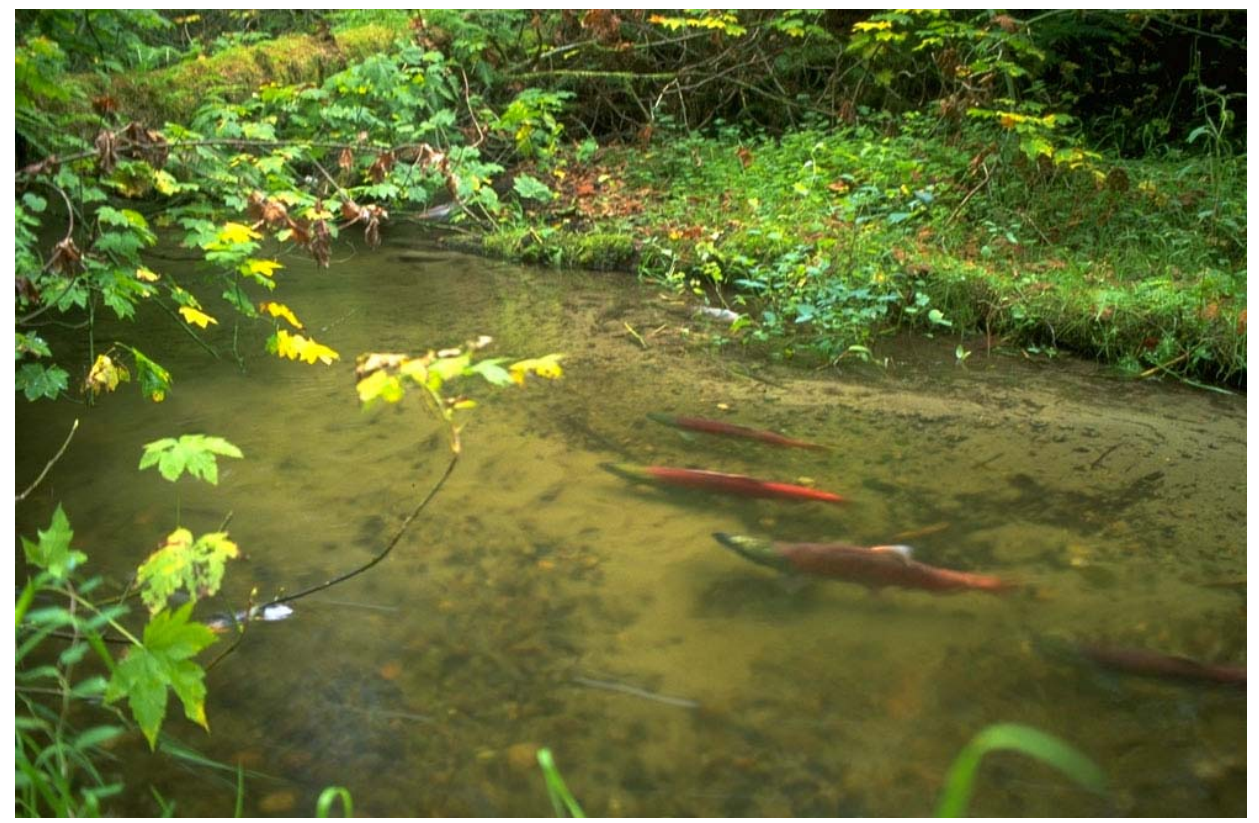
Bear Creek Sockeye Salmon