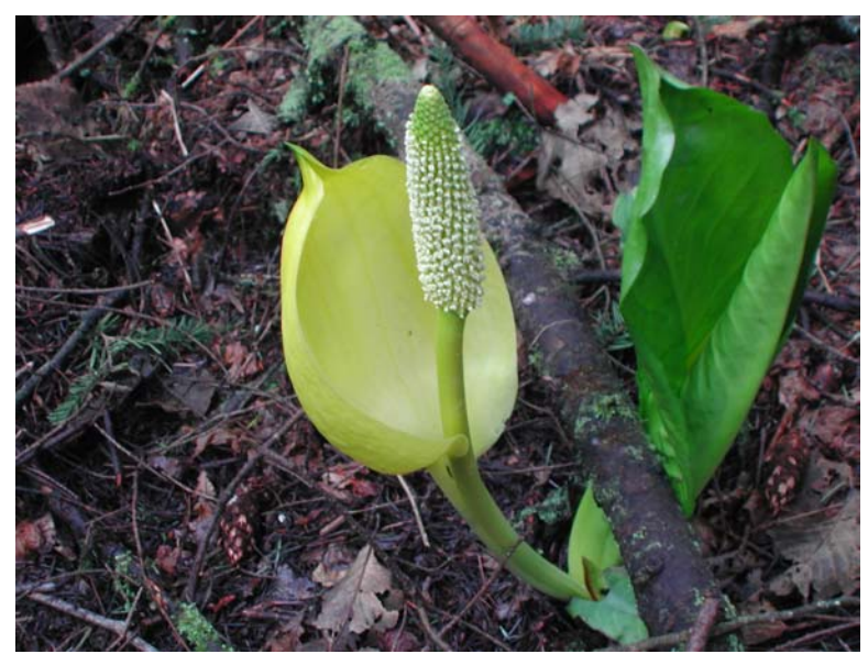
"Forest Lantern" (Skunk Cabbage) in spring bloom in Section IV

typically found in fresh water environments. They are distinguished by their plant communities