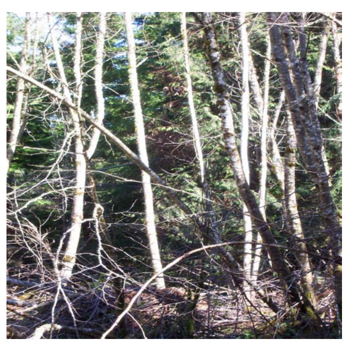
Alder grove in Section I

Section I – The majority of trails in this section are pleasant hikes over gently rolling hills covered with dense stands of Douglas fir, hemlock, white pine and maple trees. In addition, sections of trails wind through alder forests in wet areas.