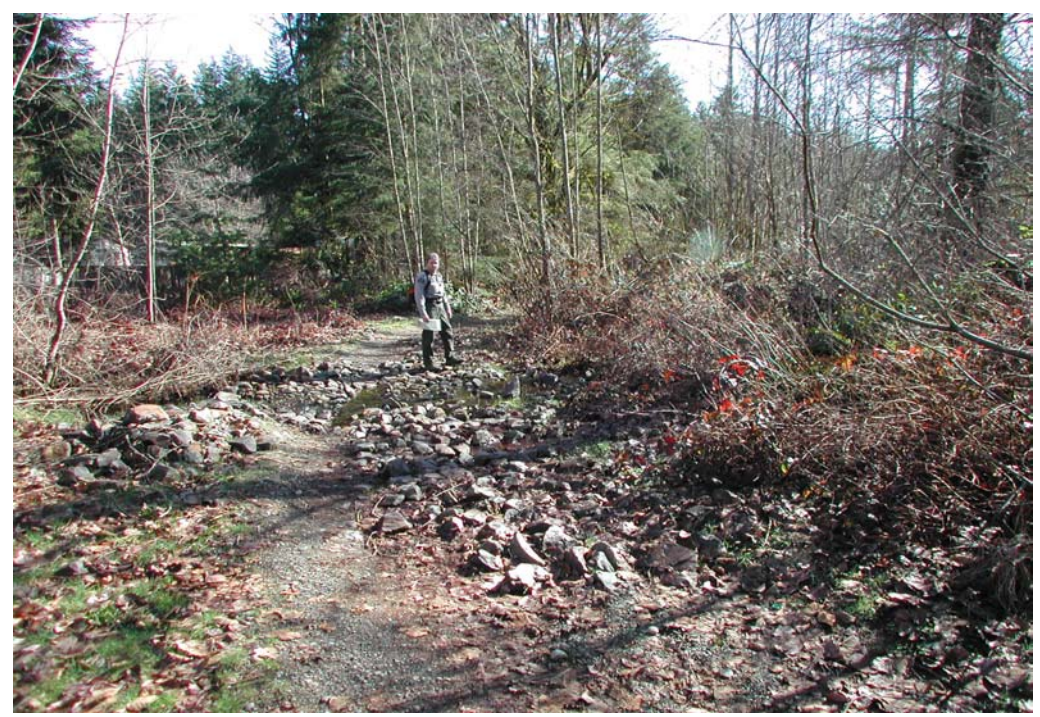
Rock placed on trail located in Section II Forested Wetland

Several trails in the southern and south central part of Section II are very steep chutes subject to extensive soil disturbance and erosion. According to Davey Lloyd, some of these chutes were used to skid logs down hill. "We used horses to drag the logs down the hills," said Davey. "Then we had the horses pull us back up the hill...the horses got quite a workout." Now, heavy rainfalls contribute to the erosion of these gullies. That erosion and soil disturbance problem has been exacerbated by hikers, and horse, bike, motorcycle, and off road vehicle use. The steep chutes flow downhill onto an abandoned logging road that also served at one time as a railroad bed for trains used to export logs from the site.