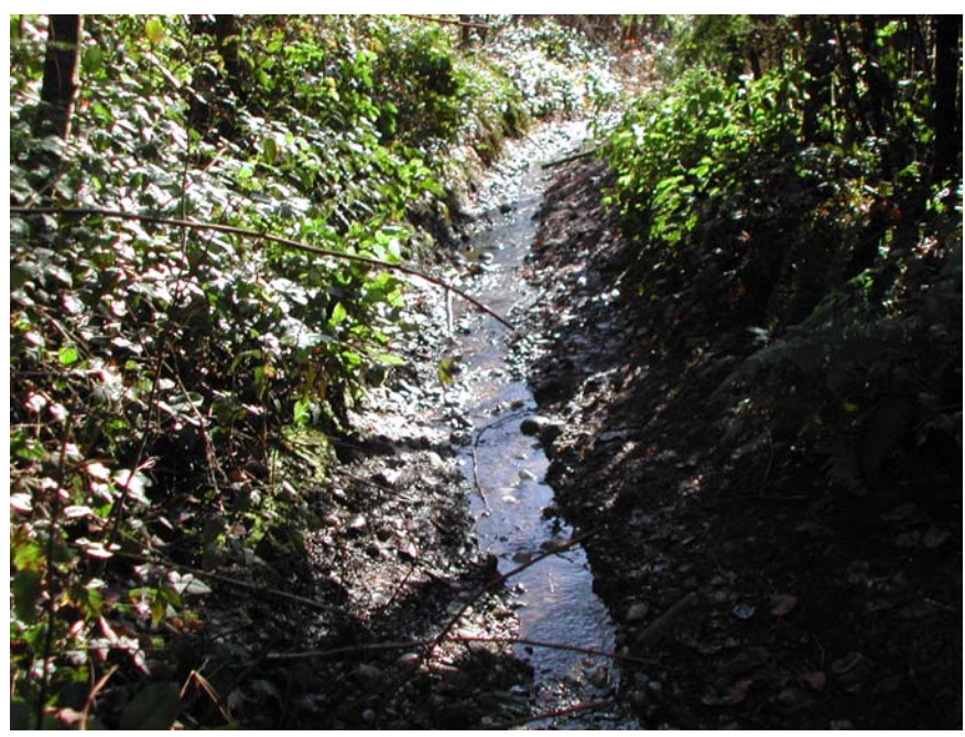
Trail on north end of Section II with flow of spring fed water

Surface and subsurface water flows from Section II move in a southerly direction to a wetland system on property south of the PVCA that is still owned by the Lloyd family. Much of that water collects in a wetland system on the Lloyd family property. Cottage Lake Creek flows out of that wetland system.