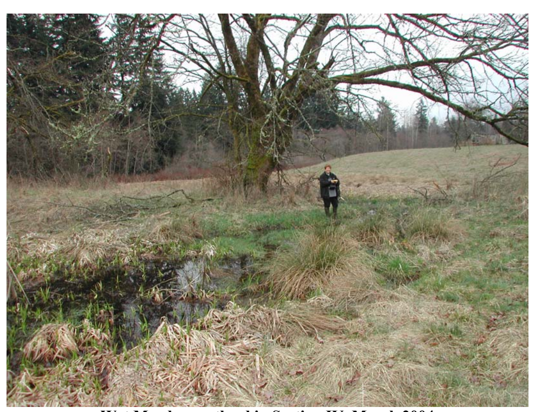
Wet Meadow wetland in Section IV, March 2004

Bog Wetlands: Bogs are usually found in isolated depressions created about ten thousand years ago by remnant chunks of glacial ice. Generally, they receive all or most of their fresh water from rainfall or groundwater. Neither water source contain much dissolved oxygen or nutrients; consequently, bog soils are nutrient-poor and with low levels of dissolved oxygen. They generally support sphagnum moss and other acid tolerant mosses that accumulate as peat. Other plants such as sundews are carnivorous; they get nitrogen and other nutrients from captured insects. Bogs which are relatively rare in western Washington are often used to grow acid-loving berry crops, such as blueberries or cranberries.