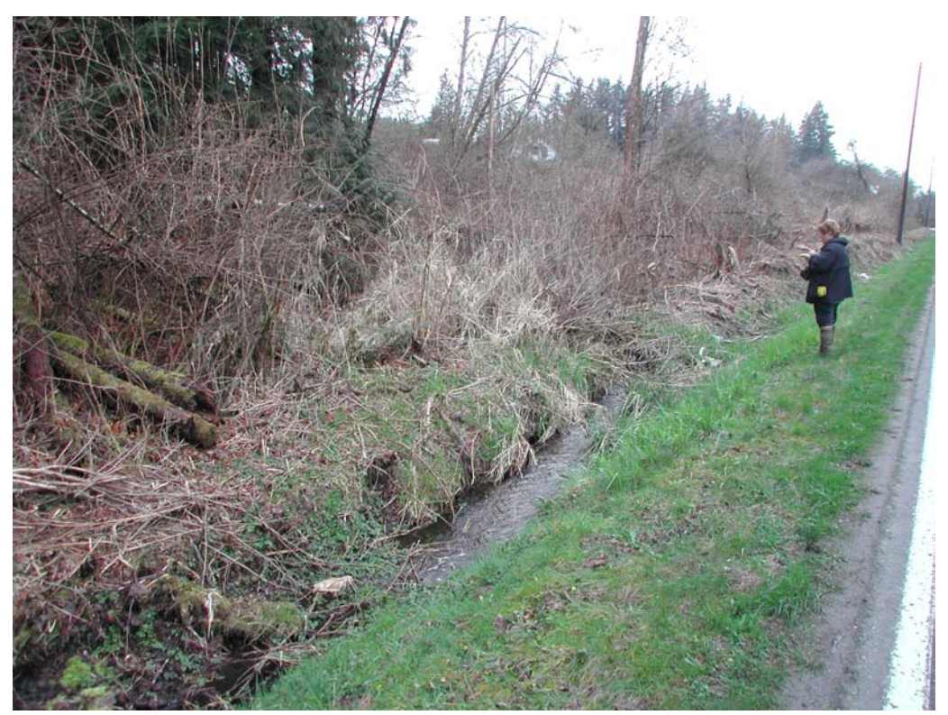
Water from Section III wetland plateau wetland flows into stream next to Paradise Lake Rd. en route to Bear Creek in Section IV. Lloyd cabin is in background.

The Lloyd Life Estate, cabin and farm outbuildings are also in this section. Currently this section has been subject to use by off road vehicles, mountain bikes, horses, and hikers.