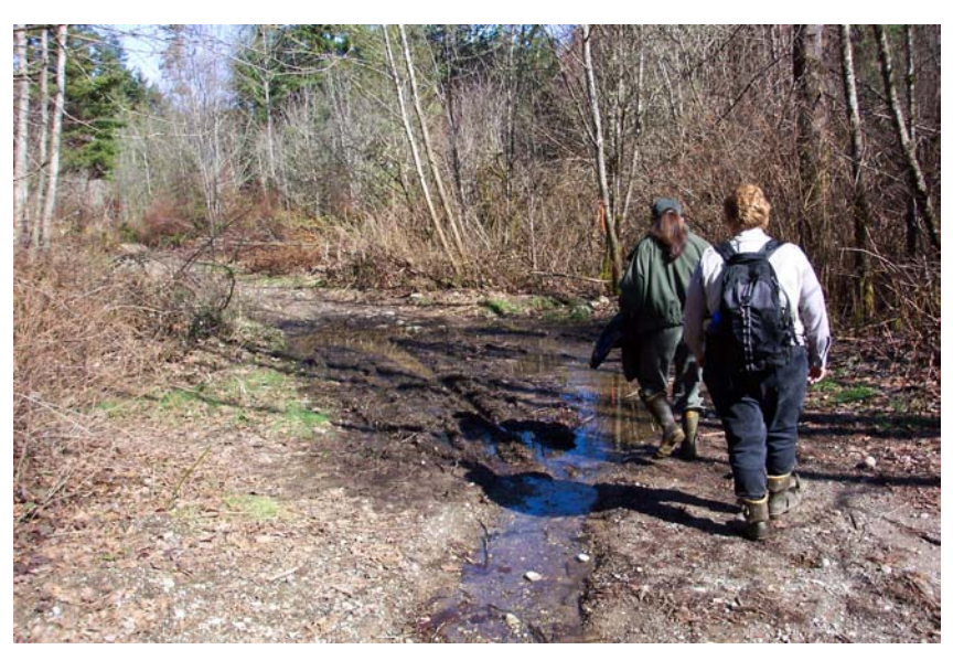
Spring flows across Section II trail

Section II – The most complex trails in the PVCA are in this section. One trail in the NW part of this section has spring fed flows that, according to Park Rangers, flow the majority of the year down the trail.