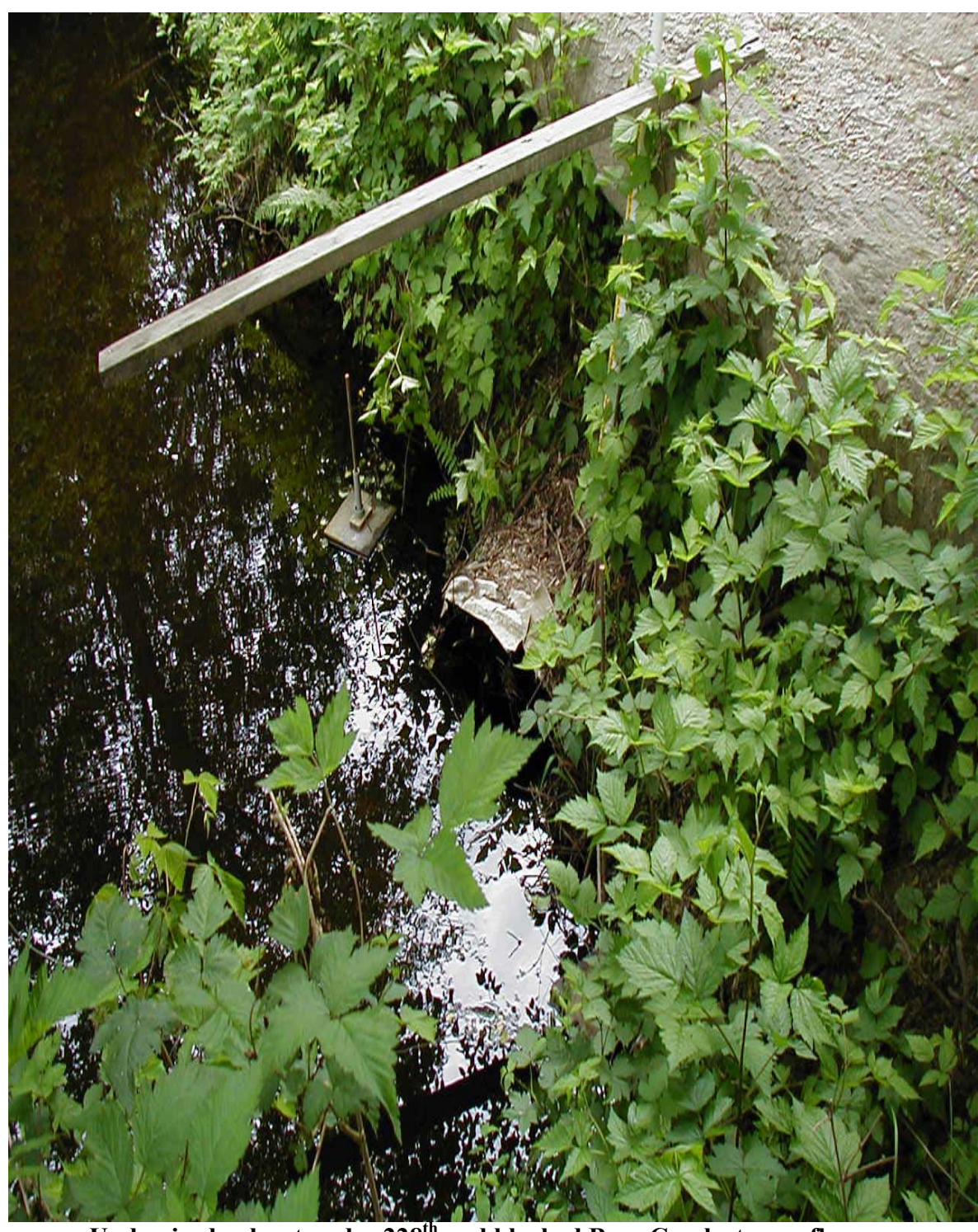
Undersized culvert under 228th and blocked Bear Creek stream flow

There are significant additional opportunities for stream restoration both up and downstream from "easement" road crossing. Bear Creek's salmon runs will benefit from the installation of logs, stumps and other large woody debris (LWD) upstream and downstream from the E-W easement road. Redirecting flows from the Bear Creek