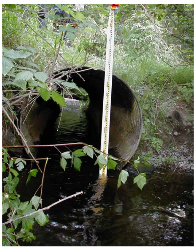
Bear Creek flowing through an undersized culvert under E-W easement road

The road immediately east of the Lloyd Family estate in Section IV extends through a wet meadow wetland. Placement of a culvert system designed to accommodate north to south flows of high winter/spring flows from that wetland system should be considered. In addition, Bear Creek flows through a culvert at the eastern edge of the PVCA on this road; replacement of that culvert with a bottomless arched culvert and/or bridge should be considered to improve fish passage.