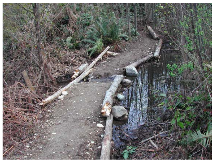
Section III trail blocks stream flow

Unfortunately, one section of the Section III trail blocks an otherwise free flowing stream that flows from the plateau wetland system to Bear Creek.