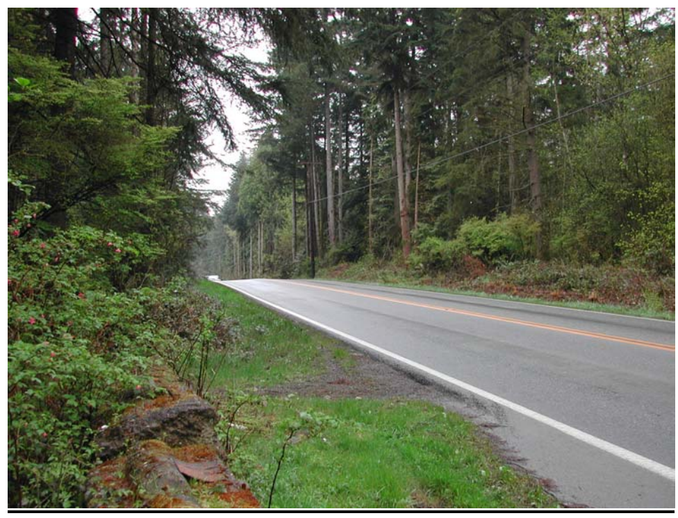
Paradise Lake Road

There are two dirt roads on site that are normally used by vehicles. One is immediately east of the Lloyd Family estate that crosses in an easterly direction from Paradise Lake Road through the center of a pasture and wet meadow wetland in Section IV. That road disrupts southerly surface water flows from the wet meadow area approximately 300 feet east of Paradise Lake Road, and a Bear Creek stream crossing (culvert) at the eastern edge of Section IV has been identified (WDFW protocols) as a partial barrier to salmon migration. Prior to selling the PVCA to the County, The Lloyd family provided formal access/egress easements to this road to six families who own property east of Quadrant four. This road is not a public access road and Snohomish County is not authorized to grant additional vehicular access easements onto County owned property.