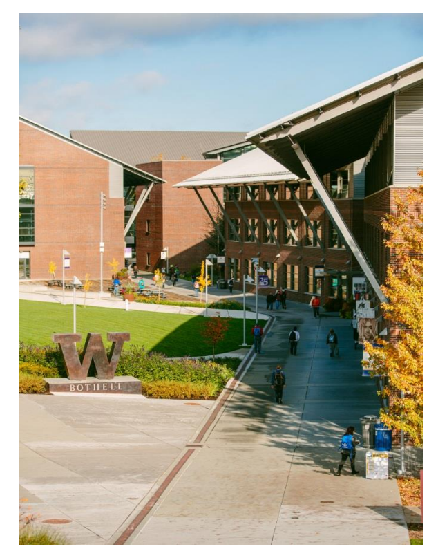
UW Bothell campus today.