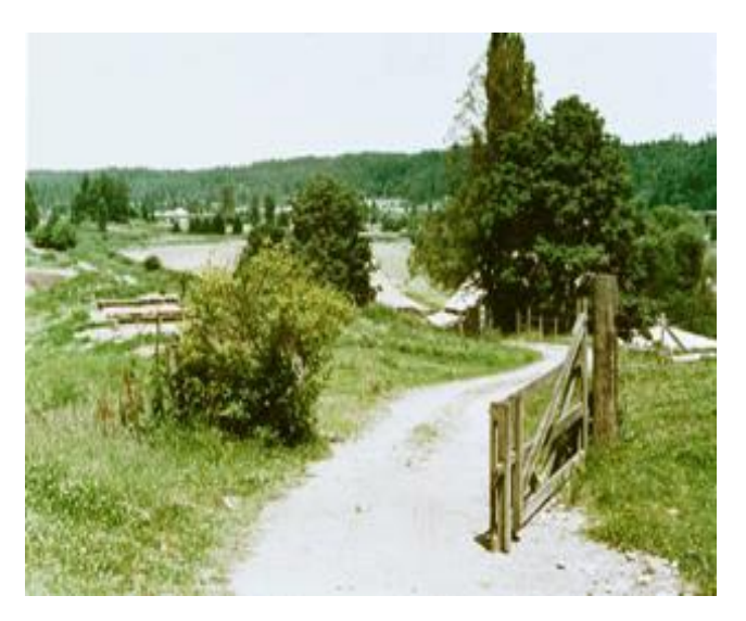
UW Bothell campus when it was the Boone-Truly Ranch.

University of Washington Bothell 18115 Campus Way NE Bothell, WA 98011-8246 Phone: 425.352.5000 TDD: 425.352.5303 Email: uwbinfo@uw.edu