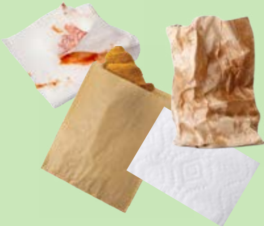
Food Soiled Paper