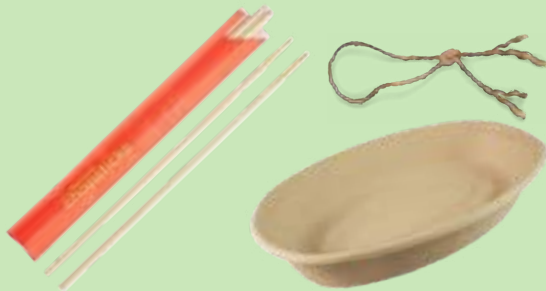
Non-Treated Wood and Wood Fiber