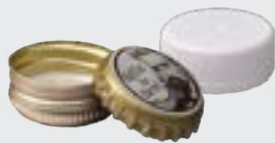
Loose lids, caps & tops (less than 3 in. wide)