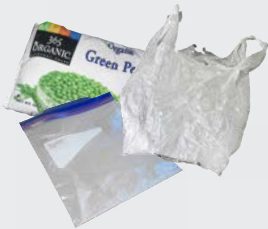
Loose Plastic Bags