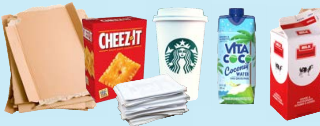
Paper & Cardboard

NO FOOD/LIQUIDS, NO PLASTIC BAGS, NO WRAPPERS, NO SMALL PLASTICS