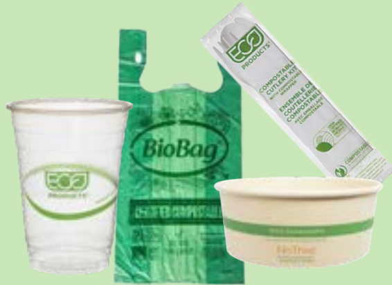
Commercially Compostable items