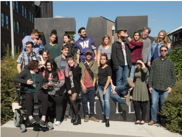
WaCC staff enjoying a moment together after pre-fall training