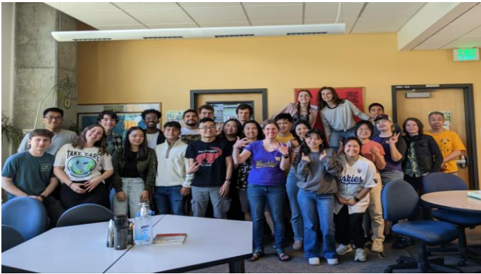
QSC staff pose together after a staff potluck

Based on ALC student session exit survey in spring 2024 n-16.