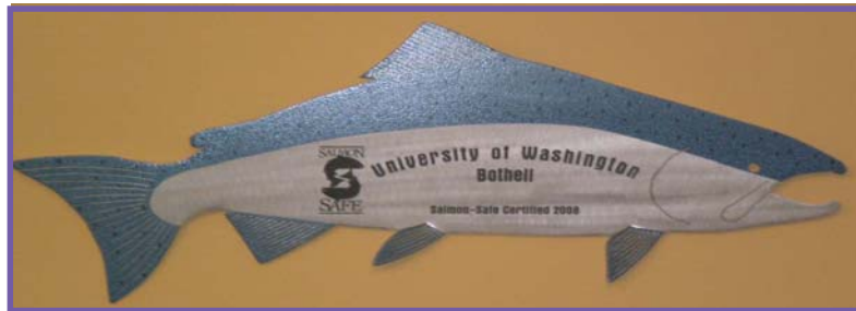
The Salmon Certification plaque is located in the Chancellor's Office.

Salmon-Safe certification means landowners go above and beyond regulations to adopt significant and specific measures that restore in-stream habitat, conserve water, protect streamside habitat and wetlands on site, reduce erosion and sedimentation, and reduce or eliminate the use of chemical pesticides through integrated pest management. Certification is awarded only after comprehensive on-site assessments by an independent team of environmental science and water quality experts based on Salmon-Safe's rigorous standards.